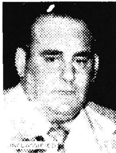
PARAGUAY'S PASTOR CORONEL